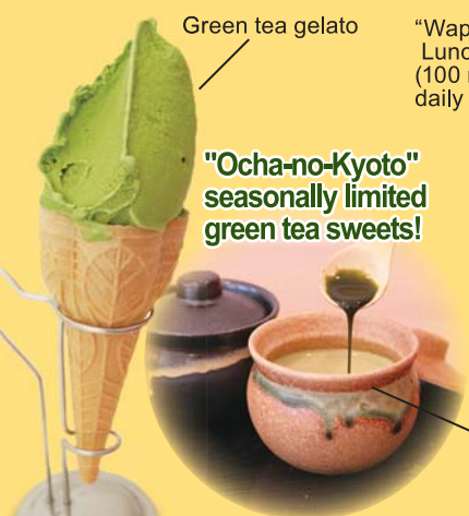
Green tea gelato