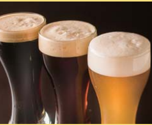
Ichijoji Craft Beer