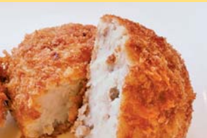
Ebi-imo croquette Ebi-imo (literally, shrimp potato) is a sort of taro.