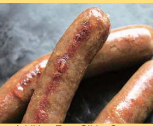
Additive-Free Gibier Sausage