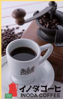
イノダゴーホ INODA COFFEE

Local products are all gathering here! We make collaboration with "Ocha-no-Kyoto". Green tea sweets and experience booth are coming this year. Kyoto prefecture promotes intermittent community business through "CHI-BIZ" project. CHI-BIZ Marche is the cooperation connecting private company and Kyoto prefecture to promote local products and sales.